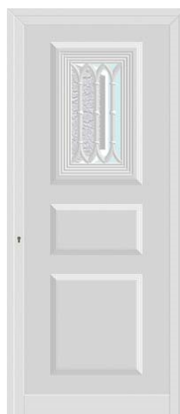
REF. 2250 (COM POSTIGO)